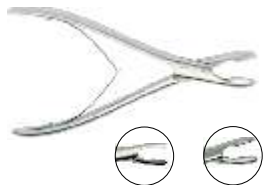
Straight Curved Bone Nibbler Single Action