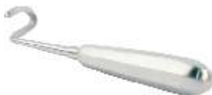
Rib Rasperactory Right